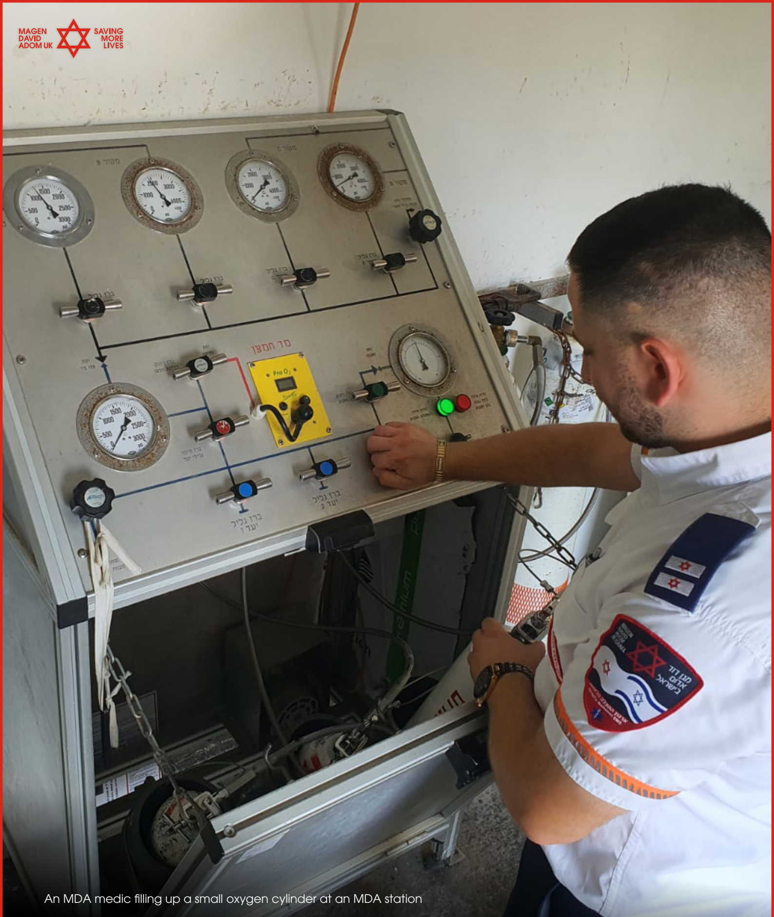
An MDA medic filling up a small oxygen cylinder at an MDA station